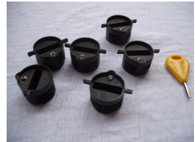
Plug set + key