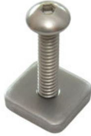
Fin bolt – fin key adjust