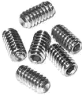
FCS style grub screw