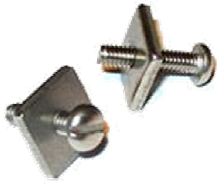
Fin bolt – screwdriver adjust