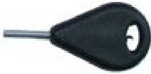
Fin hex key